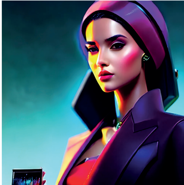
The rise of AI image generators spells a somewhat uncertain future for artists. Copyright law might need to catch up. Stable Diffusion

The Lensa photo and video editing app has shot into social media prominence in recent weeks, after adding a feature that lets you generate stunning digital portraits of yourself in contemporary art styles. It does that for just a small fee and the effort of uploading 10 to 20 different photographs of yourself.